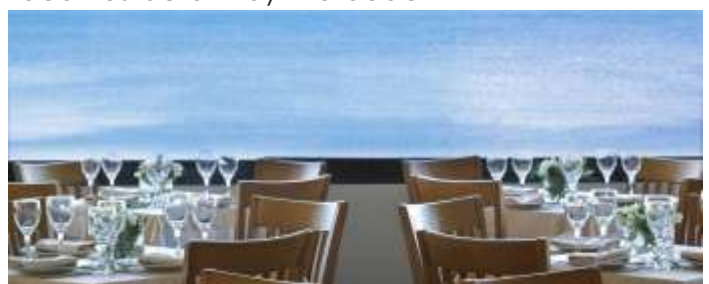
Local restaurant by the beach